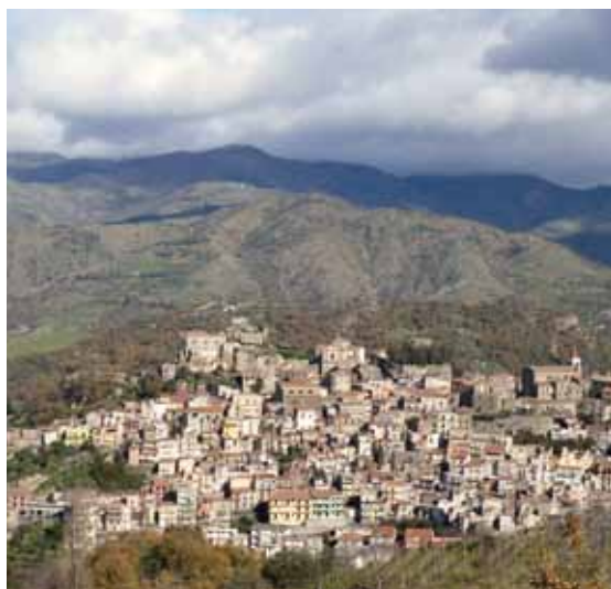
Castiglione di Sicilia - view

The old town centre has a number of monuments that bear witness to past epochs under different rulers. Many of the churches and noble palaces are richly decorated. The church of Sant'Antonio Abate, in one of the oldest quarters, has marble inlay work, a Baroque façade and a Gothic-Byzantine belfry. The church of San Pietro e Paolo is notable for its bell tower dating from 1105 and the Basilica of La Madonna della Catena for its monumental Baroque façade. Near the Alcantara