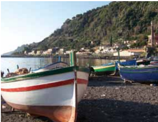
The Timpa - Santa Maria La Scala