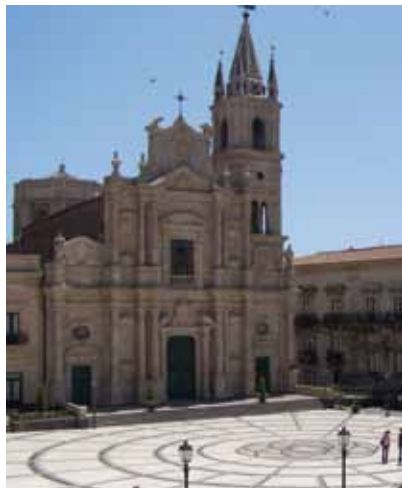
Basilica of SS Pietro e Paolo

In the meanwhile, there were continual contrasts between the town of Aci Aquilia and the other villages which led to a separation in 1628 which, after a momentary precarious appeasement, became permanent in 1640. The other villages became baronial lands but Aci Aquilia remained Crown property with the denomination 'Reale' (Royal) and the loss of the name 'Aquilia'. During the 17 C the layout of the town began to take on a more structured appearance with a road system radiating out from its central Piazza Duomo. The terrible earthquake on 11th January, 1693 destroyed many of the town's monuments, but extensive rebuilding works took place and new palaces and churches replaced them. The old streets were widened and new ones built. Acireale acquired its eighteenth-century, Late Baroque appearance thanks to the work of distinguished craftsmen like the painter, Pietro Paolo Vasta and the architect, Paolo Amico. Since then the town has grown considerably, both in demographic and economic terms, and has gradually become more administratively and politically important. Acireale has expanded considerably since WW2 with an increase in the number of businesses involved in citrus-fruit cultivation and tourism. It was awarded the title of City in 2005.