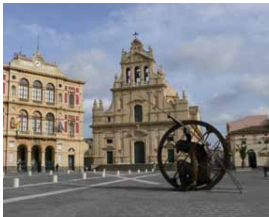
"Piazza Carlo Maria Carafa"