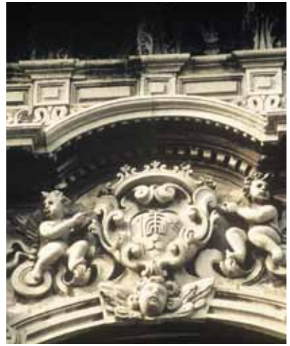
Benedictine Monastery - detail

The University of Catania has ancient origins. Founded in 1432 by the Aragonese sovereigns it was the first university in Sicily. Little is known about its original site, all that is known is that there was a building which occupied an area to the north of the Platea Magna (see Piazza Duomo). Building works began for a palace on the present site in 1684. After little more than a decade this building collapsed, probably as a result of damage caused by the 1693 earthquake, and the present building was erected around 1720.