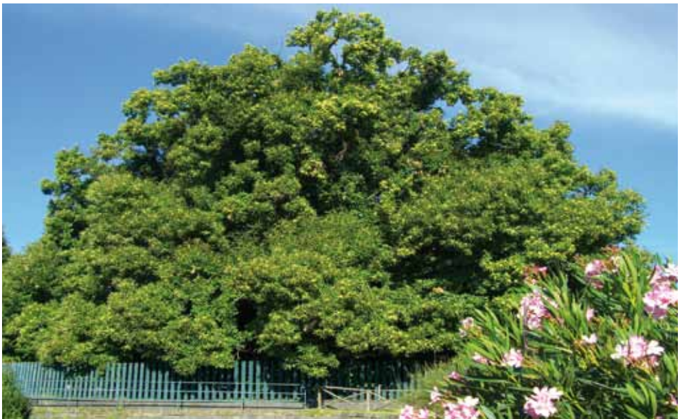
Hundred Horse Chestnut