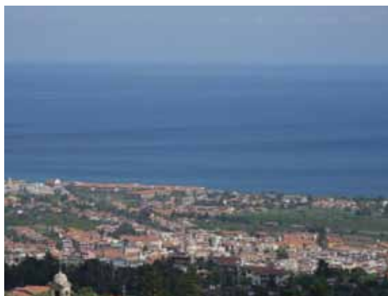
Mascali - view

Summer is the tourist season in Mascali given the strategic position of its ten quarters, set in a beautiful landscape that ranges from the hills of the Etna Park to the Ionian Sea, only 30 km from Catania and 15 km from Taormina. Fondachello and S. Anna are seaside quarters with pebble beaches. Just behind the beach there is the extraordinary, protected natural environment of Gurna, a wet zone that extends from the mouth of the River