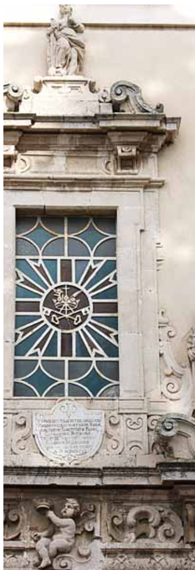
Mother Church - detail