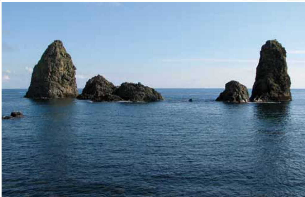
Acitrezza - Cyclops Stacks