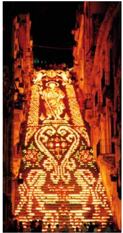
S. Maria del Monte staircase

The centuries-old art of pottery-making has been part of the history of Caltagirone since ancient times and has made it famous all over the world. Generations of craftsmen and artists have followed on from one another each interpreting in their own original way the ability of the potter to create shape and colour. The area also produces a large variety of agricultural produce, cheeses and other hand-made delicacies.