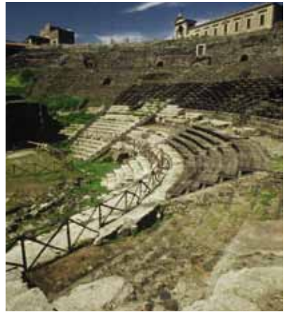
The Roman theatre

The Roman theatre, possibly one of the most important Roman monuments in the city and probably built on top of an earlier Greek theatre, was built up against the southern slopes of Montevegine, on top of which stood the Acropolis of the ancient city.