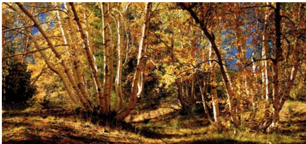
Etna Nature Park

Also called 'the Pearl of Etna', Zafferana Etnea is popular with visitors who are attracted by the spectacular views that it offers and by its artistic, monumental and cultural heritage. The most important church is the Mother Church, dedicated to the Madonna della Provvidenza which was built in different phases. Its Baroque-style façade is made of white Syracuse stone with three portals and is enhanced by twin bell towers. It rises above an imposing, curved black stone stairway that contrasts with the white façade. Inside there is an altar piece representing St. Joseph with the Child. A short distance from the Mother Church is the church of the Madonna delle Grazie with its pleasant exterior architecture and Liberty-style façade which has a niche containing a statue of the Madonna delle Grazie. The Town Hall (Palazzo Municipio) stands in Piazza Umberto I in the town centre and is a good example of Liberty style with a crenellated cornice, floral inserts at the centre of the main elevation above the balcony of honour and a stuccowork inspired by the town's coat of arms with an eagle holding two bunches of grapes in its talons positioned above a medallion that depicts Etna erupting. Access is by means of a spectacular, curved, double flight of stairs with Liberty lamps. Villa Manganeli is of considerable architectural interest. It is the most stately building in the town,