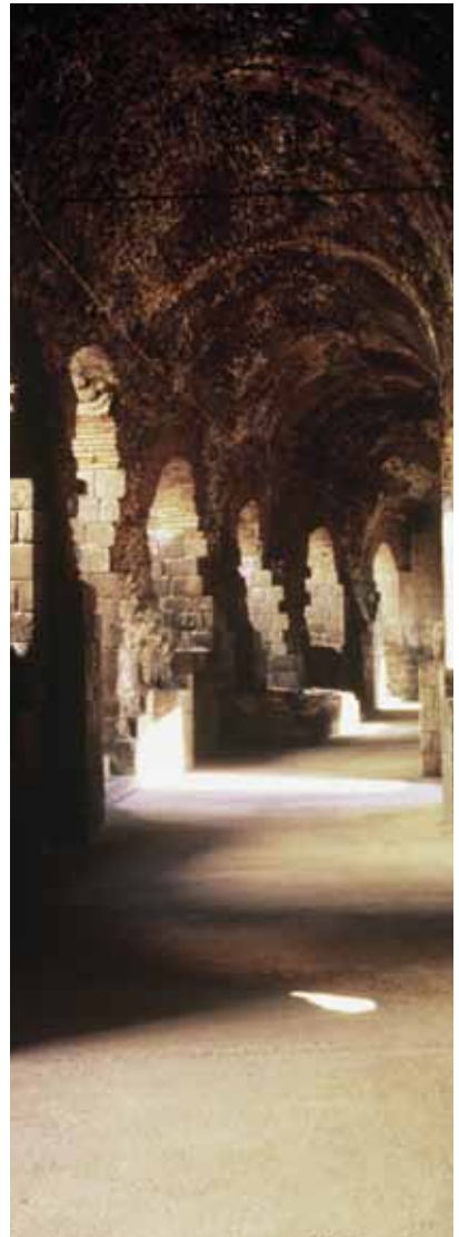
The Roman theatre

The remains of these 2 C Roman Baths are to be found in the 18 C part of the city. The building contained a caldarium and a frigidarium besides the furnaces for heating water and air and the channels for supplying and running off water. The foundations of other rooms have also been found.