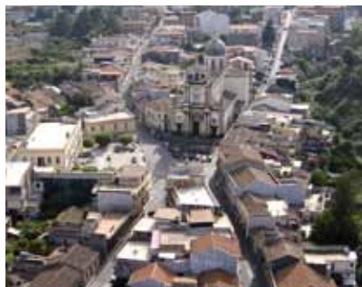
Santa Venerina - view