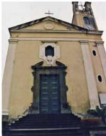
Sant'Agata al Velo Church

From an architectural point of view one of the most interesting monuments is the Mother Church, dedicated to Maria S.S. Annunziata. It has a Romanesque façade with a lava stone stairway leading to the porch where there is a beautiful portal again in lava stone, expertly worked by local craftsman. Above the portal is a decorative window which, since 1969, has contained the bust of Sant'Agata which was previously kept in the church of Sant'Agata al Velo. There are some beautiful artefacts in the church including a wooden cross and a painting of San Lorenzo, patron saint of the town. The painting is a copy of the 'Martyrdom of San Lorenzo' by Tiziano, the original belonging to the Jesuit Church in Venice. Above the main altar there is a beautiful painting of the Annunciation of the Virgin Mary, dating back to the end of