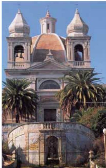
Church of San Giuseppe