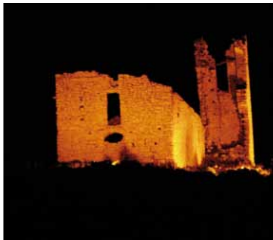
Remains of the Church of San Michele Arcangelo

From Catania Car: A19 CT-PA exit Gerbini – S.S. 192 direction Castel di Iudica Bus: AST