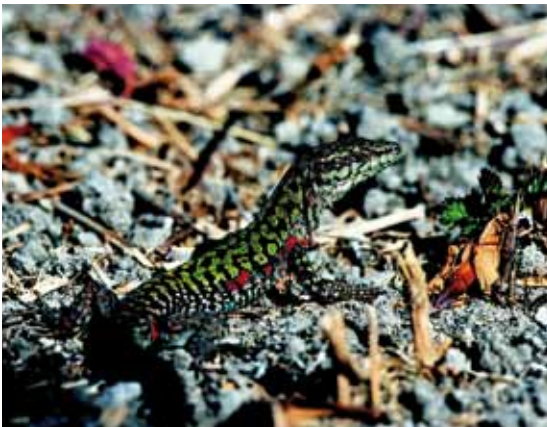
Rare Podarcis Sicula Ciclopica lizard