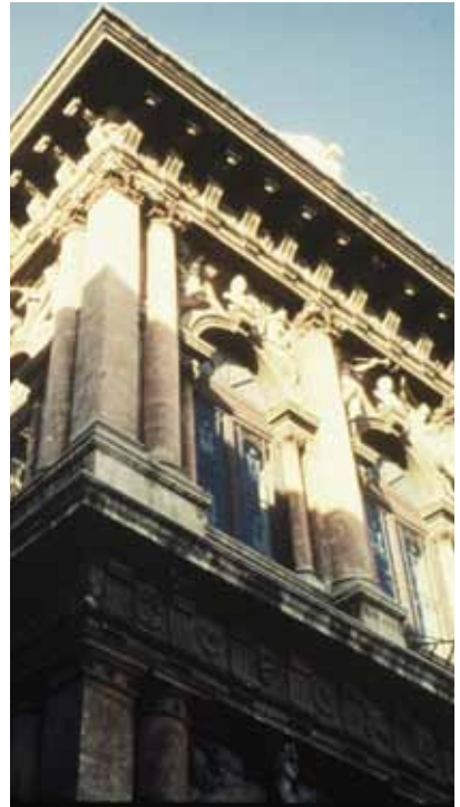
Teatro Massimo - detail

Widespread urban expansion took place in the 20th century which, in some cases, caused great damage to the original urban layout, one example being the building of the present-day Corso Sicilia which necessitated the demolition of the old San Berillo quarter in the heart of the old town. There are numerous Liberty style villas between Piazza Santa Maria di Gesù and Piazza Roma, in via Androne and along Corso Italia.