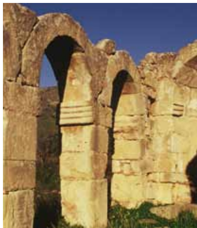
Early Christian Basilica of San Giovanni

From Catania Car: S.S. 417 exit Palagonia Bus: AST