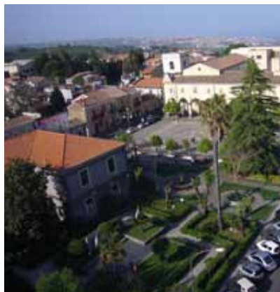
Valverde – main square

The most important monument is certainly the Sanctuary of Maria SS. di Valverde in the centre of the town, which is of medieval origin even if it was reworked over the following centuries. Along the central nave, illuminated by ten stained glass windows, on the left visitors can see the altars to the Madonna del Rosario and the Madonna del Carmine, an elegant late 18 C wooden door and the altar dedicated to S. Nicola da Tolentino with an anonymous painting dated 1706. To one side of the main nave is the altar to the Madonna di Valverde, built in finely inlaid polychrome marble with an artistic balustrade. At the centre of the altar, protected by a small door in embossed silver, is the icon of the Madonna. The Convent of the Barefooted Augustinians can to all effects be considered as forming part of the Sanctuary. The building, whose main prospect faces the Sanctuary square, like the church, forms a square with a large interior courtyard. The oldest part of the building