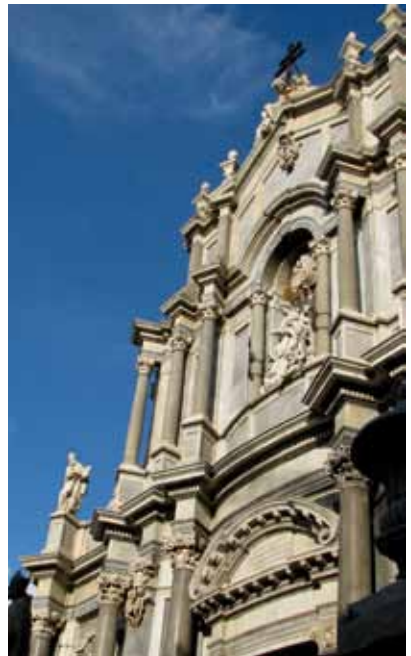
Cathedral - detail

Instead, the Cathedral became their burial place. During the reign of King Alphonse the Magnanimous the first University in Sicily was founded (1434). The 15 C was