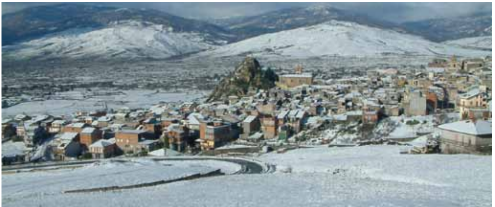
Maletto - view