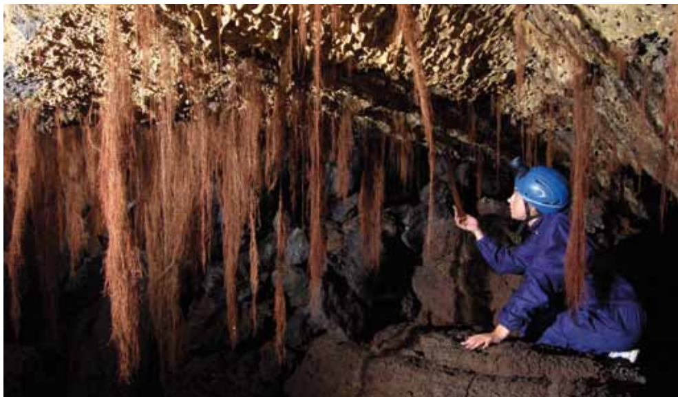
"Grotta dei Tedeschi"

the reserve. Some of the caves are also of archaeological interest having revealed finds dating back to the Early Bronze Age.