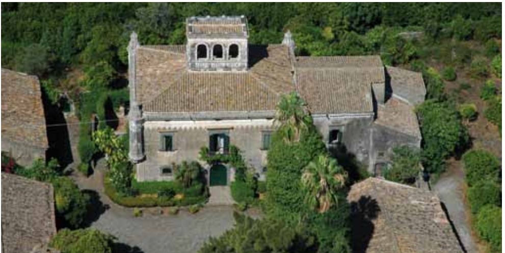
The Slave's Castle

marsh flora including common purple loosestrife, water iris and other species. Along the banks the common nettle, angelica, bindweed and water hemp are frequently found. Near the Quadare spring there are also the remnants of an old, white willow wood. Overall, besides preserving some extremely interesting floral and vegetational aspects of the zone, the Reserve is also a refuge for different species of sedentary and migratory birds that winter and nest there, because it is the only remaining wetland, together with the neighbouring marshy area 'La Gurna', along the Ionian coast from the mouth of the Simeto to