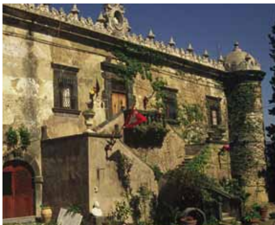
The Slave's Castle

There are several interesting places to visit among which the Slaves' Castle (Castello degli Schiavi), a remarkable example of Baroque architecture which was built as a country residence in the second half of the 18 C. The adjoining small church is also of interest with a painting of the Madonna and Child, probably the work of Pietro Paolo Vasta. The Slaves' Castle owes its fame to having been used as a set for a number of films among which 'The Godfather'. Palazzo Corvaia is located on a small square in the Diana quarter and is an elegant example of the kind of villa-farmhouse that was built in the 18 C as a noble residence. The Red Tower (Torre Rosso), at