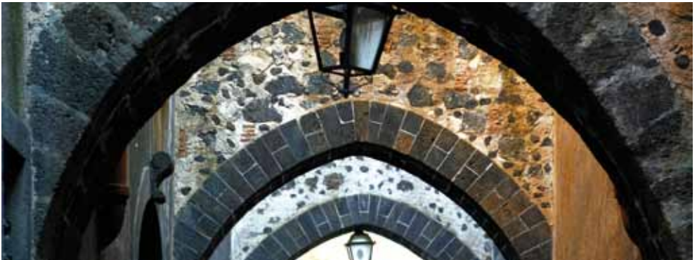
"Via degli Archi"