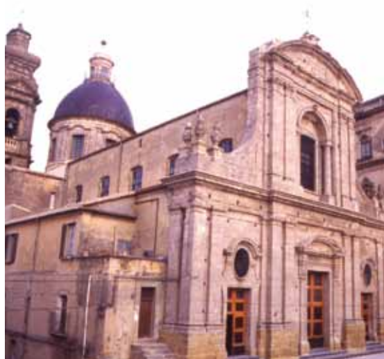
Church of S. Maria del Monte