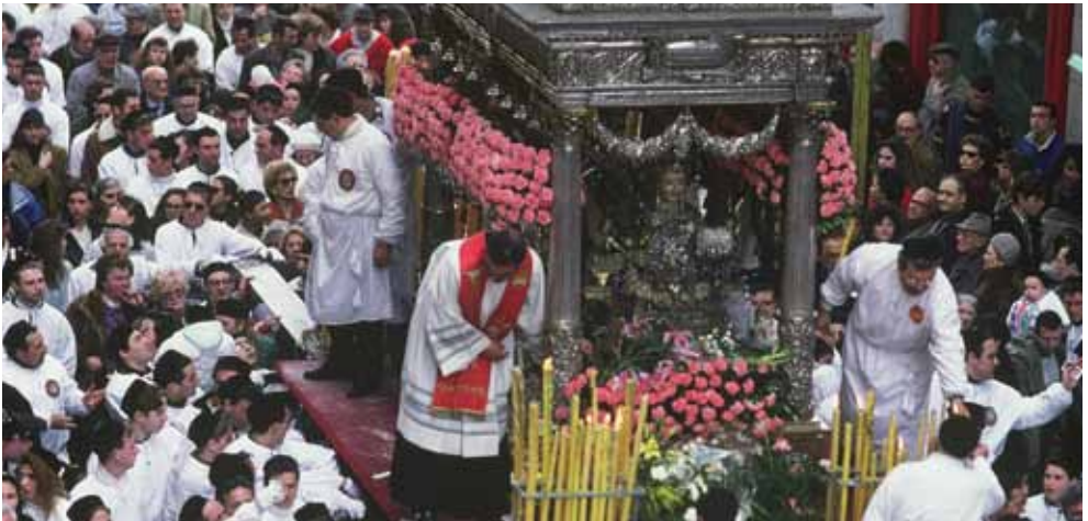
Feast of St. Agatha