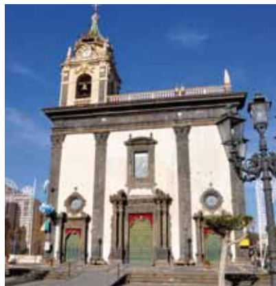
Church of Santa Maria dell'Idria