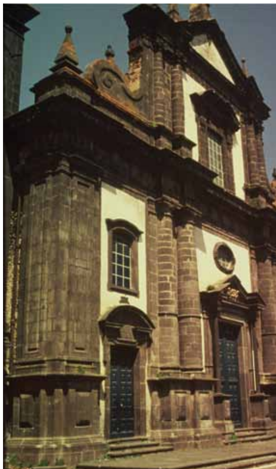
Church of San Martino