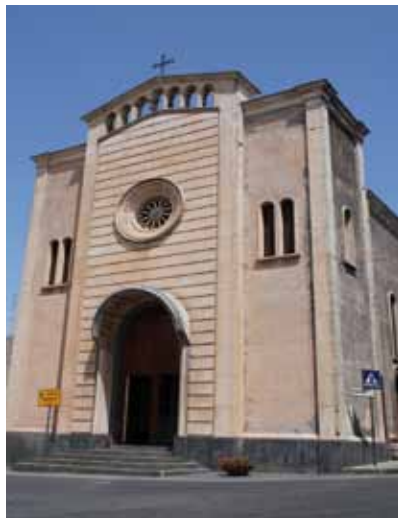
Church of Santa Barbara

Also known as the 'terrace of Etna', Ragalna offers visitors the delightful sight of Piazza Cisterna, set on many levels connected by elegant steps. The name comes from the presence of the old cistern for collecting rainwater originally built to make up for the town's lack of springs. There are many cisterns in the town but this is the best preserved. The square also contains the Mother Church, dedicated to the Madonna del Carmelo dating from the 19 C. In a narrow street there are the remains of the Church of the Canfarella, probably the first church to be built in the town. It is now deconsecrated but some frescoes can still be seen on the walls. It has been private property for a long time and forms part of a complex of rural buildings. In Piazza S. Barbara there is a church of the same name. Building work began on this in the 1920s with the help of many churchgoers who after services went to a nearby quarry and returned with a load of stone. The Serra La Nave Astrophysical Observatory research centre is situated at 1,700 m.s.l. Walkers will be interested in the numerous lava grottoes to be seen such as the 'Grotte del Catanese', which is one of the most beautiful on Etna, consisting in a single gallery, just over 20 metres long with a characteristic ogival form.