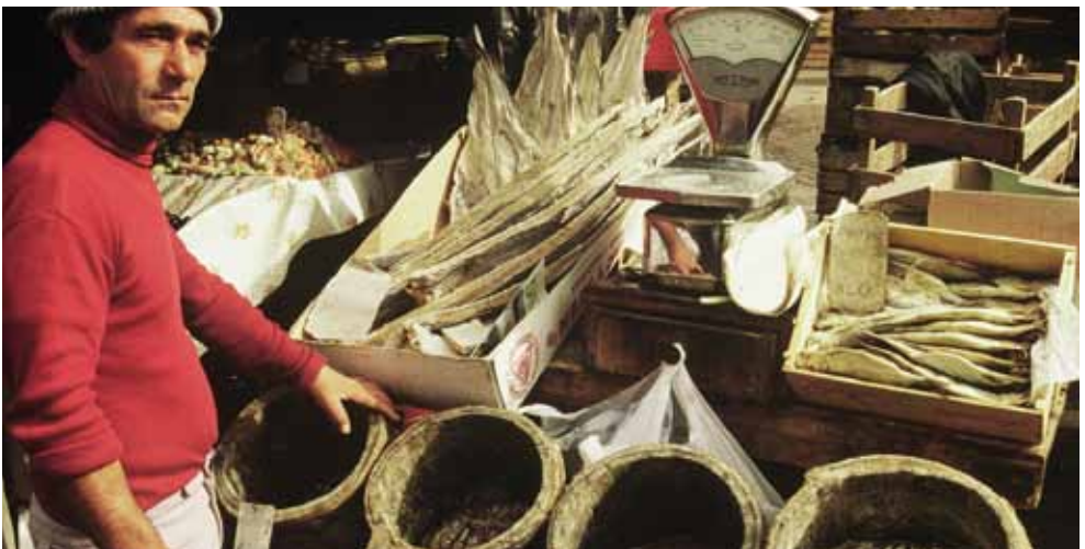
The Fish Market