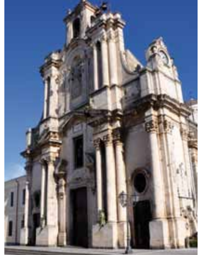
Mother Church of Sant'Antonio Abate