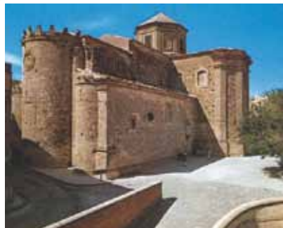
Santa Agrippina – apse

represents a boar hunting scene, a theme that was common in Greek art and also associated with funerals.