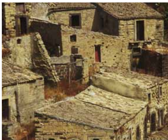
"Cunziria" (old tannery)

At the beginning of the 15 C, the town layout was modified by expansion outside the medieval walls. In 1536 after the accession of Charles V of Hapsburg the town, both to protect itself against the dangers posed by the nearby Barons and also to thank the government, began to buy, at a high price, a series of 'privileges' and 'titles' such as 'perpetual state property', 'pure and mixed empire' and 'very obedient city', as well as obtaining the possibility to elect a Town Council. Until the first half of the 17 C Vizzini continued to expand, reaching a total of 16,000 inhabitants. Nevertheless, although it had become an increasingly influential town its medieval history of constant strife with the liege lord to whom it had been 'sold' continued. This occurred in 1648 when it was given in fief to Nicolò Squitini from Genoa. It