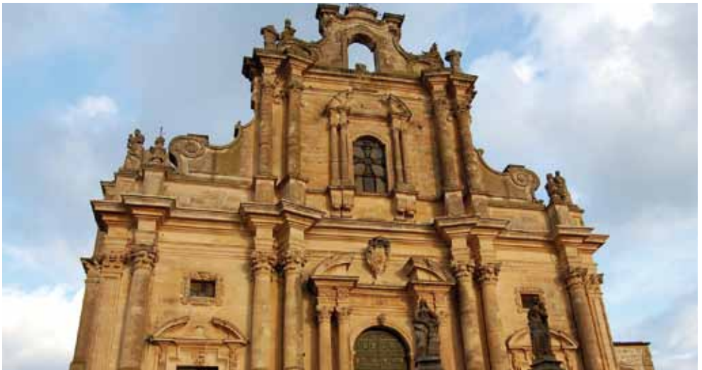
Church of San Giovanni Battista

• Christmas celebrations with live Nativity Scenes