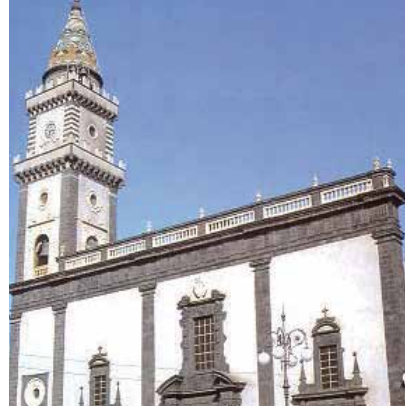
Basilica of Santa Caterina