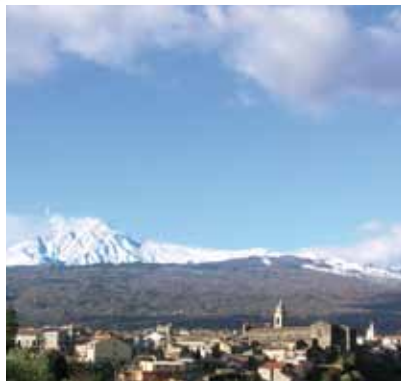
Linguaglossa - view

The old town is well preserved with numerous narrow streets where visitors can discover ancient doorways, Baroque buildings and admire the contrast between lava stone from Etna used for bases, windows and masks and sandstone and tuff from nearby highlands. The most important feature of the town, however, are the small late-nineteenth century and Liberty-style palaces that give onto the main street and the squares, such as the Town Hall, the work of Pietro Grassi (1907) with its elegant, mired, mullioned windows. The Mother Church was built in 1613 and contains a wooden choir dating from 1728 and many fine paintings. The church of S. Edigio, patron saint of the town, was built under Angevin rule and has a splendid Gothic portal with the town's coat of arms. It is sited in the middle of the oldest medieval quarter. The 17 C church of SS. Vito e Antonio with its lava stone portal and the 16 C church of S. Francesco di Paola with a famous marble statue of the Madonna dell'Oretta by Gagini (1478-1536) are of considerable architectural interest. The church of Gesù e Maria, built in 1600 has been closed to worship for the last twenty-five years. It is extremely simple having