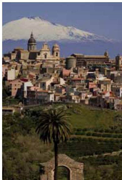
Militello Val di Catania - view