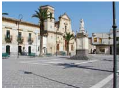
Church of San Rocco

The old town centre preserves a number of architecturally interesting monuments. The Mother Church, dedicated to the patron San Rocco, is located in Piazza Umberto I. It contains some important frescoes and excellent paintings. The square is graced by some 19 C mansions such as Palazzo Paoli-Migliore and Palazzo Modica. The main historical palace in the town is undoubtedly Palazzo Branciforte, dating back to 1628. The main entrance is through a tunnel surmounted by the central loggia. In 1644 building work began on the church of S. Antonio di Padova in Piazza San Francesco, with the adjoining former Convent of the Frati Riformati di San Francesco. The façade of the church is characterised by a simple Baroque style. Inside there are some excellent sculptures and paintings including an 18 C statue of Christ at the Column which is carried in procession on Wednesday in Holy Week. The cloister is an architectural jewel that contains 18 C frescoes which narrate episodes from the life of martyrs of the Franciscan Order. The 17 C church of Purgatory (or S. Gregorio Magno) preserves some wooden statues of the Passion Group as well as some quite interesting paintings. Of particular interest is the engraving of 'The