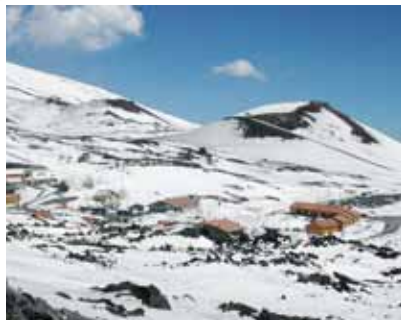
"Nicolosi Nord" ski resort

Nicolosi has an interesting artistic heritage. Vaccarini drew up plans for the Mother Church, in Piazza Vittorio Emanuele II in the first half of the 18 C. It has a 19 C style façade and an adjoining belfry in lava stone. Work on the church of S. Giuseppe was completed in 1886. The simple façade is decorated with a lava stone portal. The churches of S. Maria delle Grazie, S. Maria del Carmelo and S. Francesco are also worthy of note. Outside the town there is the ancient Benedictine Monastery of S. Nicolò l'Arena. The area is also dotted with small altars and shrines dedicated to the Patron Saints. Of particular interest are the 'Three Altars' built in the 18 C at the point where the lava stopped in 1776. There are a number of museums including the Rural Life Museum (Casa Museo della Civiltà Contadina) and the Volcano Museum (Museo Vulcanologico) which has an interesting display of lava materials from Etna. The 'Nicolosi Nord' ski resort has more than 20 km of slopes and offers skiers and snowboarders a view that takes in the whole of the Gulf of Catania and the Simeio valley.