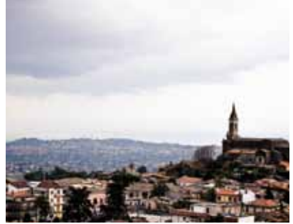
Trecastagni - view

Trecastagni has some important historical monuments and there are many charming corners for visitors to discover. One of the most notable of the noble mansions is Palazzo dei Di Giovanni which still preserves traces of the original murals. The Mother Church dedicated to San Nicola di Bari is of great architectural interest. It is built on a hill which offers exceptional views and can be reached by way of a monumental flight of steps. The 16 C interior features Etna lava stone columns that contrast with the white walls. There are carved marble altars, the stucco decorated chapels of the Sacrament and the Crucifix, a monumental organ dating from 1824 and 18 C wooden statues. The oldest church in the town is the church of the Misericordia more commonly known as the church of the Bianchi, which stands in a square bearing the same name. Its largest bell is dated 1302 although the present building was only constructed in 1734. On the main altar there is an eighteenth century gilded wooden group depicting Mercy. The façade alternates plasterwork with openings framed in carved, sculpted lava stone. The church of Sant'Alfio, now a Sanctuary, has a harmonious façade with openings framed in worked lava stone, topped by an octagonal belfry. The