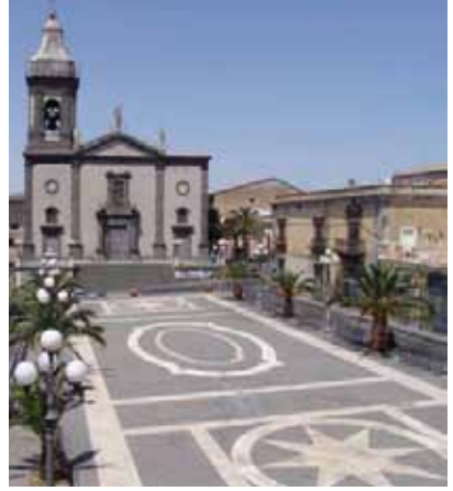
Mother Church of Santa Lucia

Belpasso is the only town in the area to feature this chessboard street plan. One of the most important churches is the Mother Church of Santa Maria Immacolata in the 'Matrice' quarter, where Santa Lucia is also worshipped. In the Bell Tower the great bell of S. Lucia, cast in 1815, is the biggest in Sicily and one of the biggest in Italy. Another interesting church is Sant'Antonio di Padova which forms part of the former convent of the Frati Zoccolanti di San Francesco. The Queen's water butt, part of the residence where Queen Eleonora D'Anjou lived, is to be found to the north-east of the town. Of the original building only one room and a structure with a small altar, originally frescoed, have survived numerous lava flows, although numerous walks belonging to the original garden can still be seen, converging on a terrace with stone seats. The round, open water butt of the villa must have collected rain water from the various terraces, but is now partially filled with volcanic material.