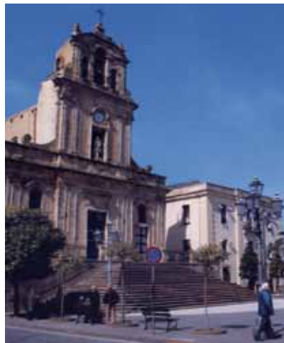
Church of the Sacro Cuore di Gesù