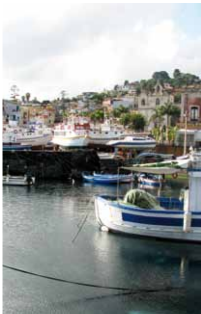
Acitrezza - Port