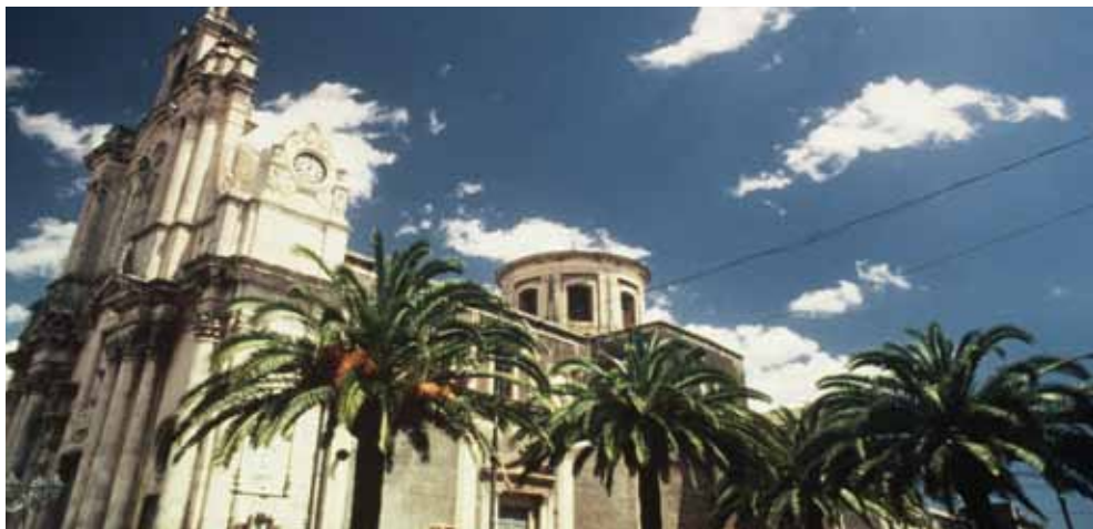
Mother Church of S. Maria dell'Indirizzo

From Catania Car: Catania Bypass RA 15 exit Paesi Etnei Bus: AST