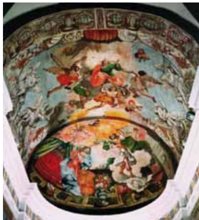
Church of Santa Maria Annunziata