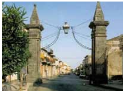
"Corso Vittorio Emanuele II"

Among its principal monuments is the Mother Church erected in the 18 C and dedicated to the Madonna del Rosario which dominates Piazza Madre Chiesa. Of vast dimensions, it is the only church of its kind in Piedimonte, being a basilica with three naves supported by massive arches that converge towards a wide apse containing the main altar. In the side naves there is a double series of precious marble altars decorated with large paintings and a 17 C polychrome wooden statue. The façade is a mixture of classical and vernacular architectural styles. The painting of the Madonna delle Grazie is very interesting due to the fact that it depicts, in their original position, many of the old town monuments that have since disappeared including the bell tower of the church of S. Michele, the crenellated mass of the prison and the first church of S. Ignazio, the Prince's Palace and the old fountain of the Mother Church. Leaving the Mother Church and crossing the main road visitors arrive at the Convent of the Capuchin Fathers and the adjoining church of the Immacolata in